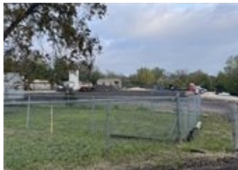
Construction recently began at the Taylor Animal Shelter.

Questions? Contact the Communications Office at pio@taylortx.gov .