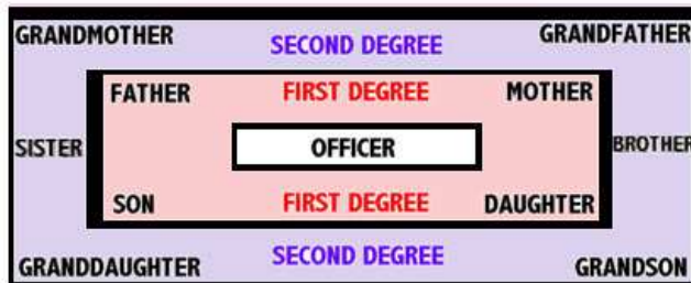
AFFINITY KINSHIP CHART